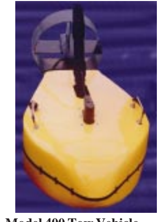
Model 400 Tow Vehicle with TC-2040 Transducers